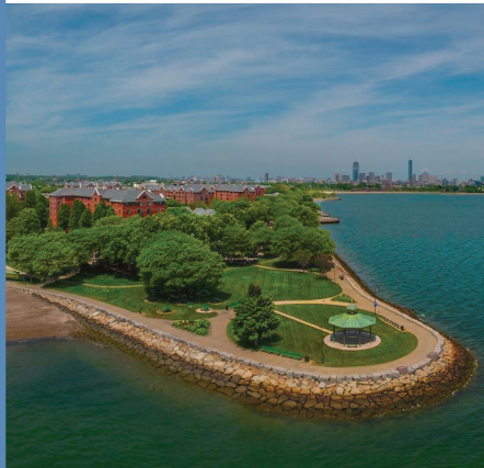
Harbor Point on the Bay Dorchester, MA