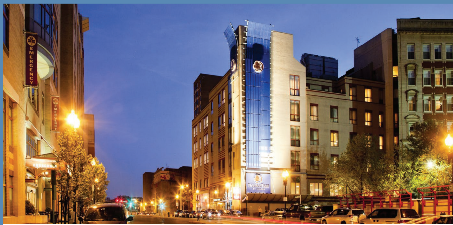
DoubleTree by Hilton Hotel, Boston - Downtown