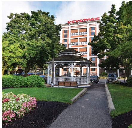
Savin Hill Apartments Dorchester, MA